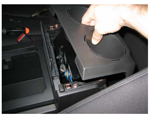
Remove the rear OEM cup holder